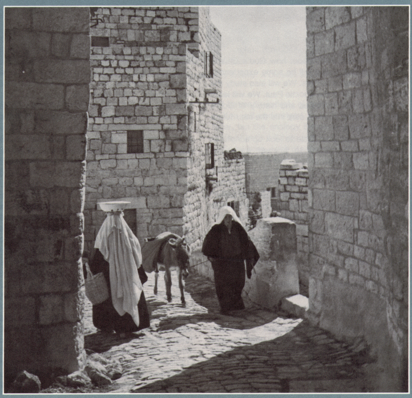
The New Testament Church