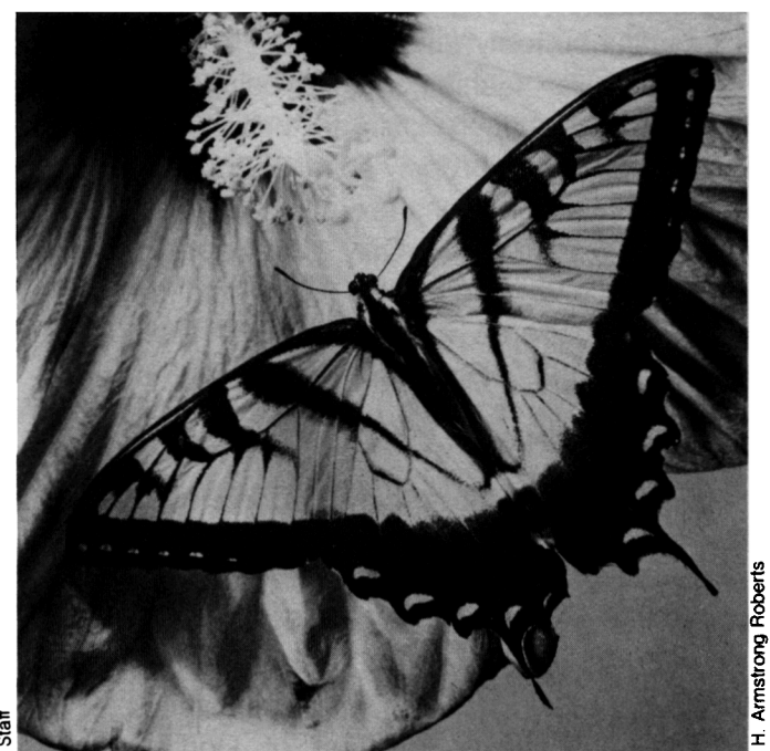
A caterpillar undergoes a series of changes to become a butterfly. A Christian also must be changed.

Spirit entering into them. God's Spirit combined with man's spirit enables a Christian to understand and live God's spiritual way of life. God's Spirit was made available to the disciples on the Pentecost following the death of Christ. So Pentecost, A.D. 31, marks the beginning of the New Testament Church of God.