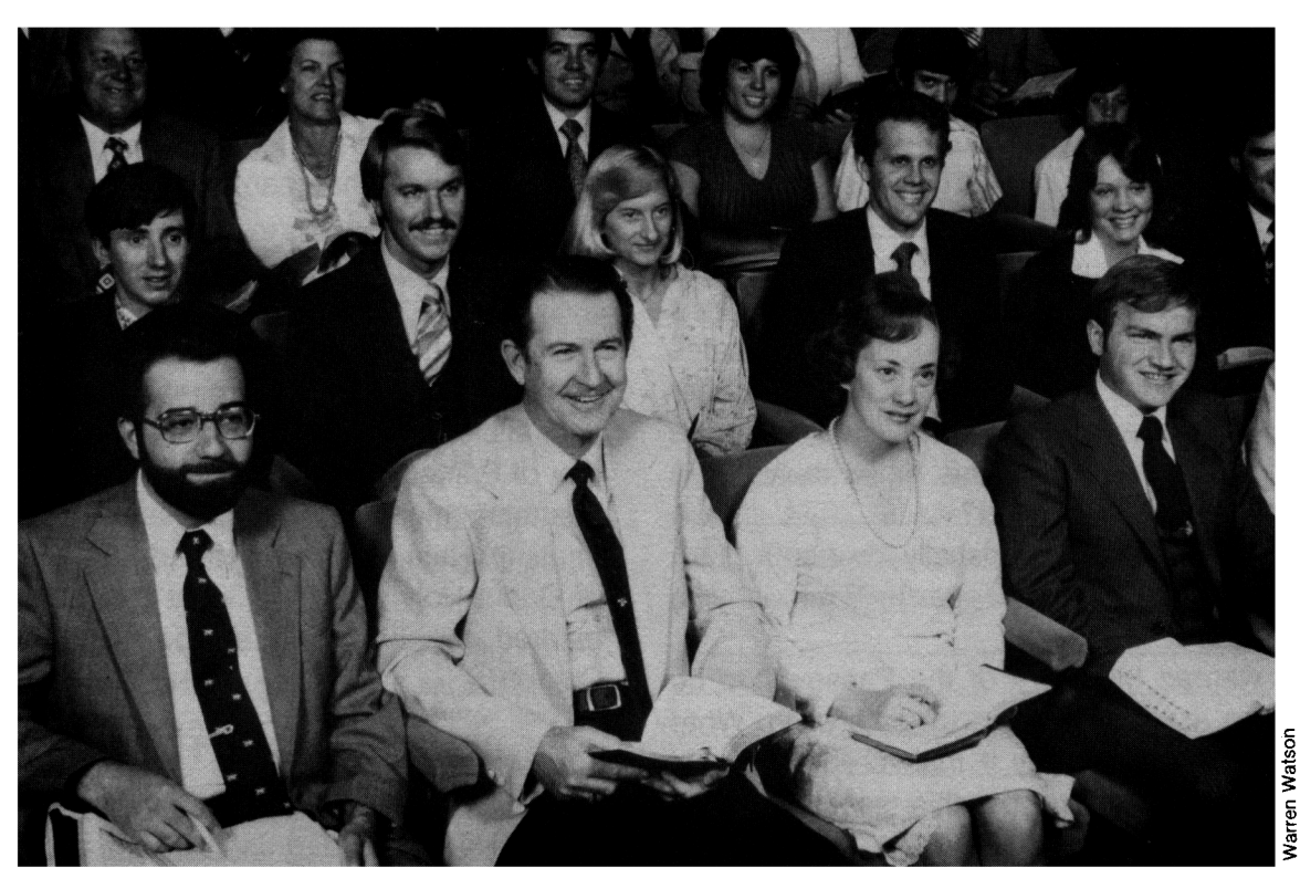
Members of God's Church being taught at Sabbath services.